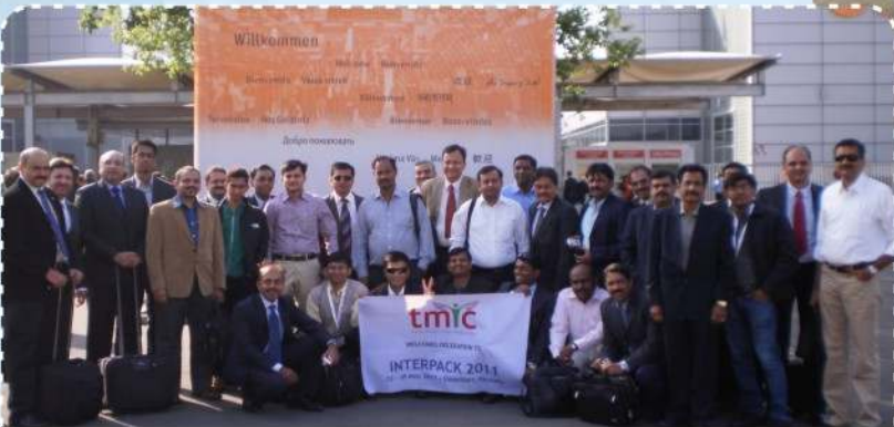
Interpack 2011, Germany