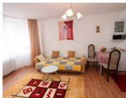
Apartment/Bed & Breakfast Hotel options closer to the fairground