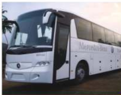
Deluxe Coach Transfers