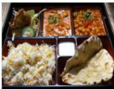
Packed Lunch at the Fairground