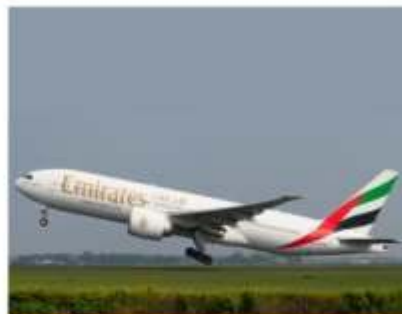
Fly on Finest Airlines