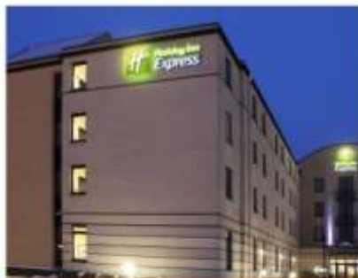
Stay at International Chain of Hotels