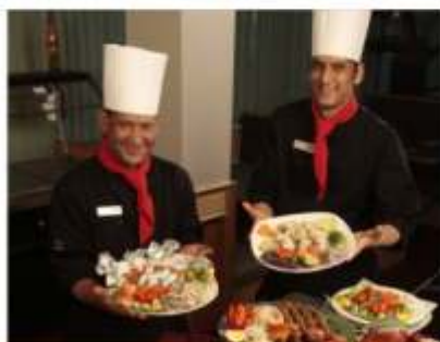
Indian Dinners In comfort of your Hotel