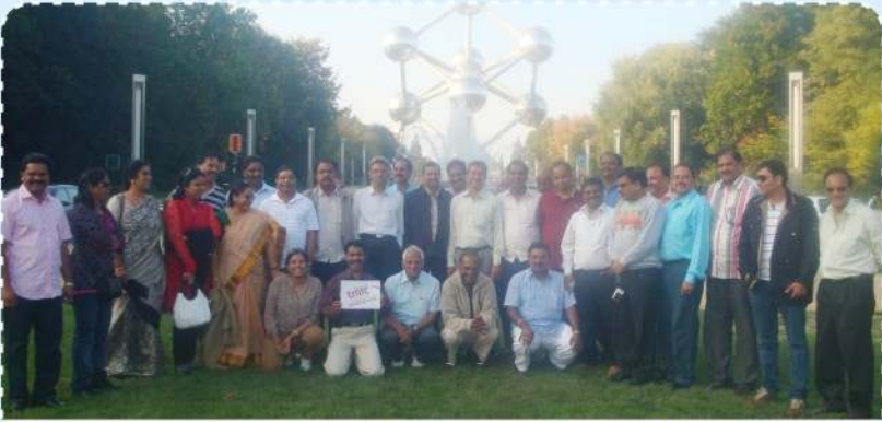
CPhI Paris 2010, France - Brussels & Amsterdam Extension Group