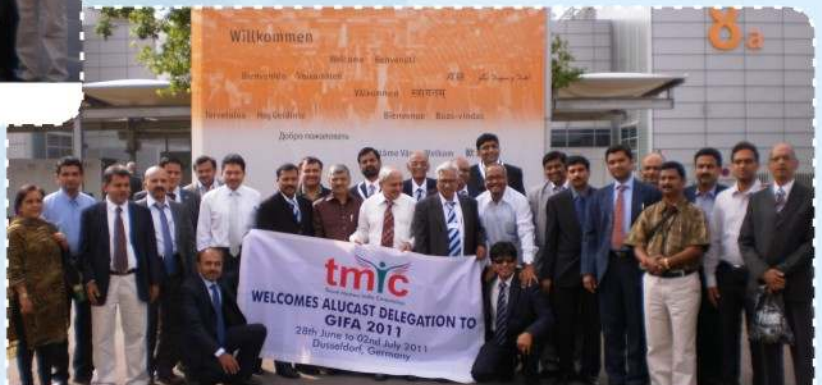
Alucast Delegation to GIFA 2011, Germany