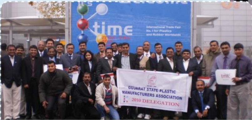
Gujarat State Plastics Manufacturers Association - K 2010, Germany