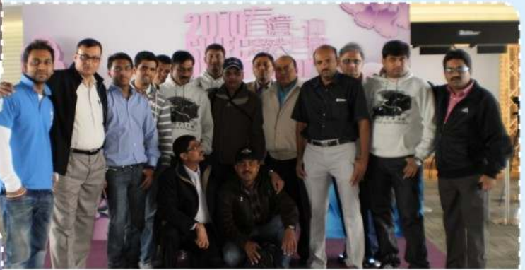
China Interdye 2010, China