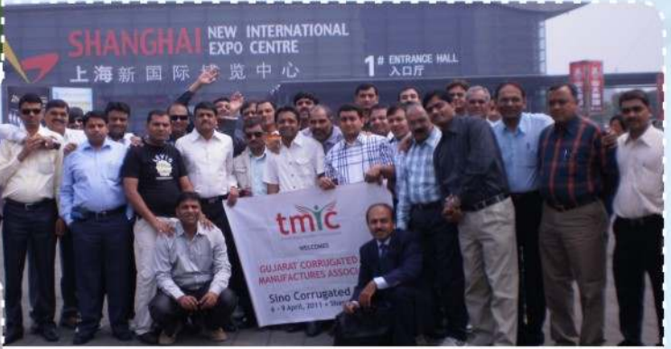
Sino Corrugated 2010, China